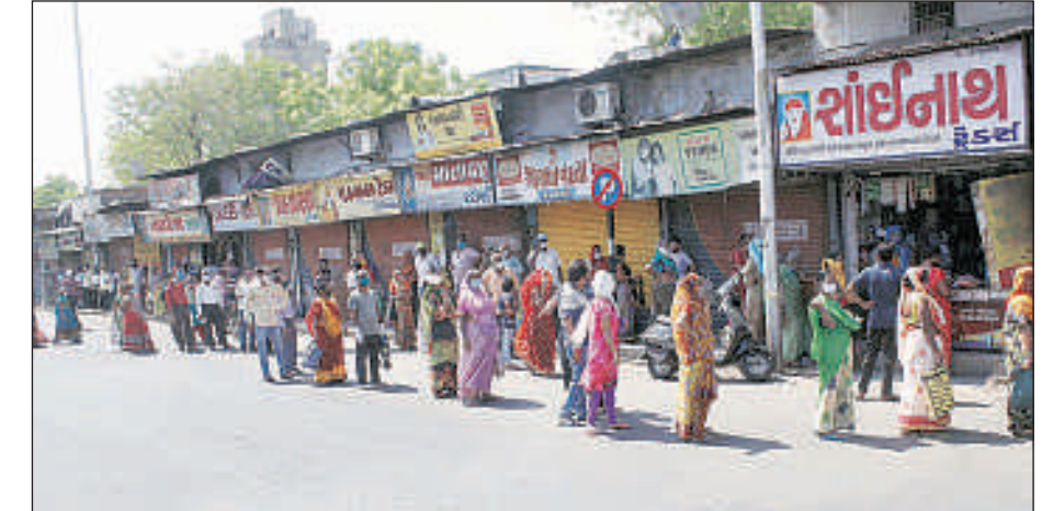
People queue up outside outside a grocery shop in Ahmedabad on Friday.

EXPRESS NEWS SERVICE VADODARA, MAY 15 A HISTORY-SHEETER who fled