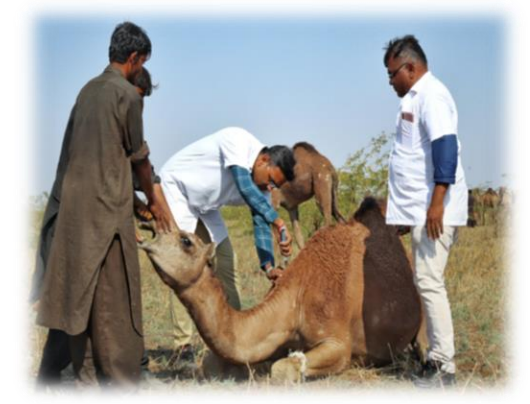
Cattle Health Camp& Lumpy Disease Vaccination Drive