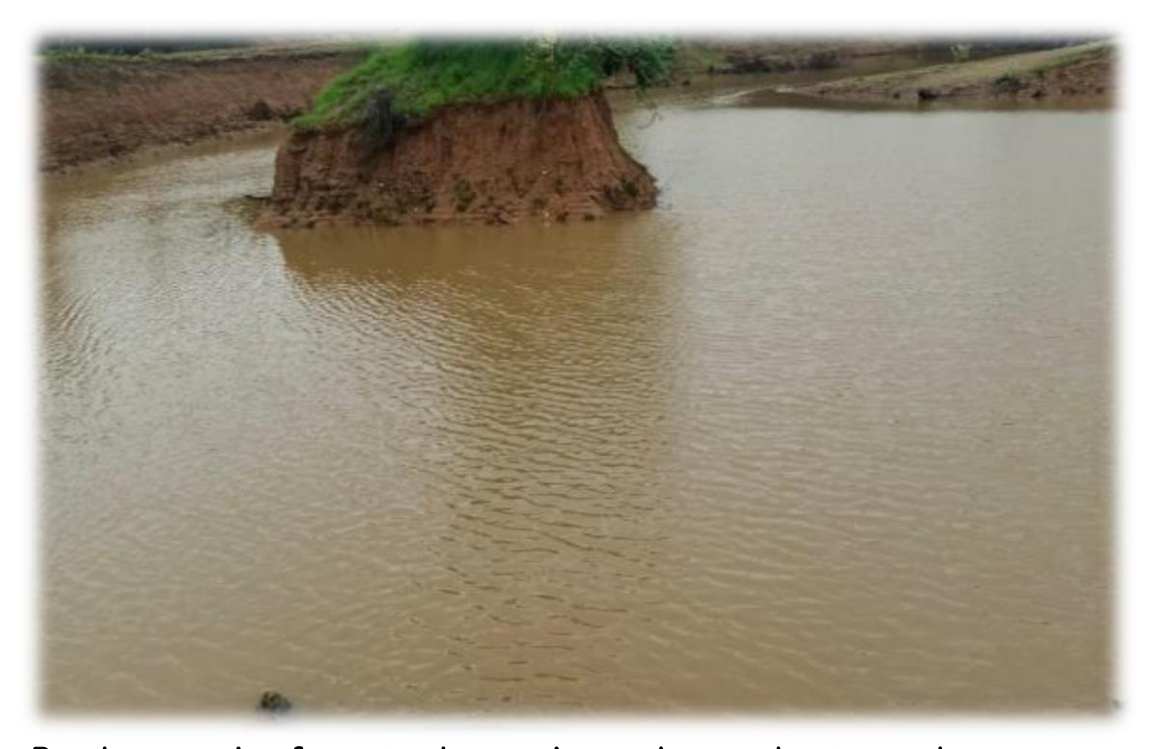
Pond renovation for water harvesting and ground water recharge