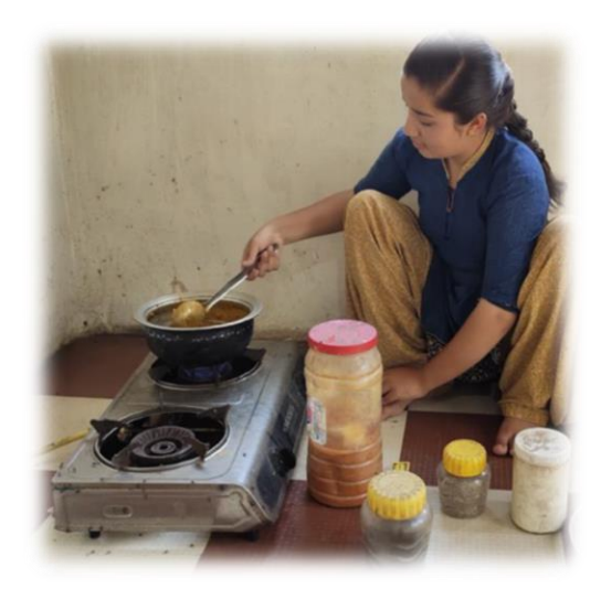
Biogas Support to 100 Farmers by Linkages through DRDA