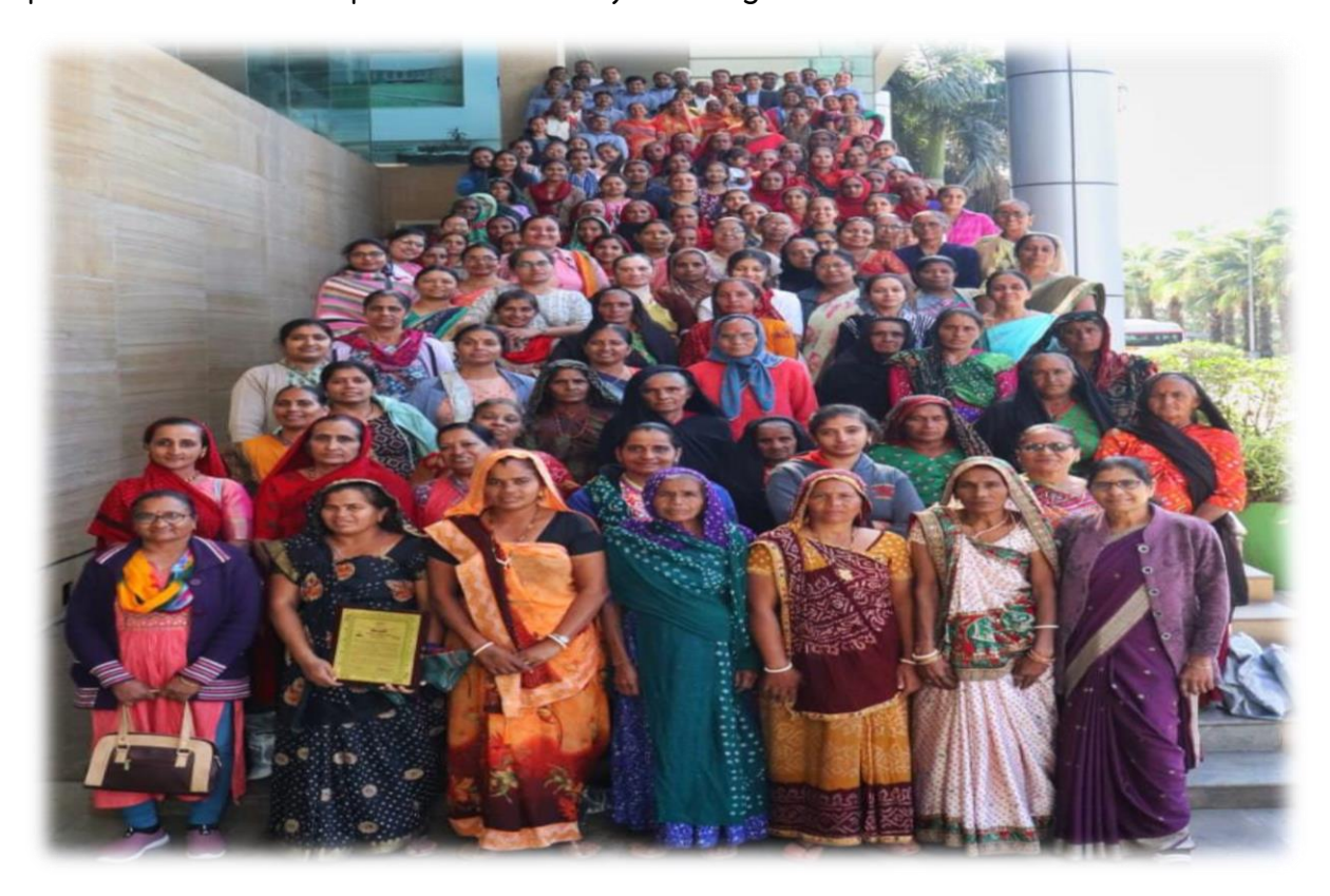
Event organized on "Women Farmer's Day Celebration" on 23<sup>rd</sup> December 2022

On theme of "Annadata sukhi bhava" means 'those who are providing me with this food, let them be happy'. Honored 150 women farmers who proved her selves as a farmer entrepreneur from Mundra and Mandvi Taluka. Also, awarded 12 women farmers for their outstanding contribution as a farmer in society. Mineral mixture kit was given to each woman farmer. Information's provided on various schemes/initiatives by Government and other organizations. Technical solutions provided on various problem faced by farming communities.