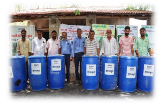
Promotion of Natural Farming