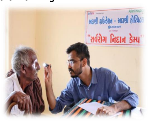
Medical Support and Health Check – up at Nearby villages