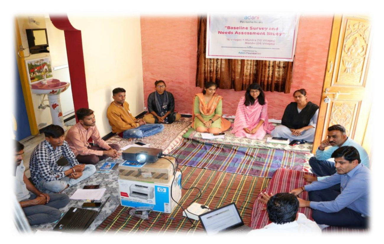
Photo: Stakeholder consultation process by SAVE Pvt. Ltd. as part of "Baseline and need assessment study".